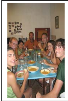
Volunteers are rewarded with a fresh organic meal after a hard day of weeding.