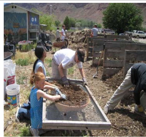
Connecting the circle: youth learn the importance of composting.